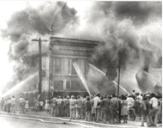
The 1949 fire in Downtown Rosenberg.