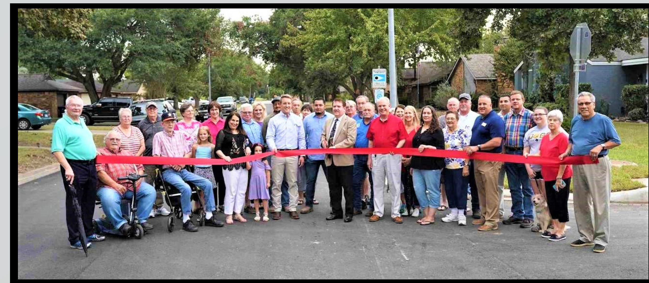
The storm drainage project to improve storm water runoff conditions within the Glenmeadow area is now complete. Pictured are members of the community along with Mayor Benton, Commissioner Morales, Councilor Wallingford & Mayor Pro Tem Raines at the Ribbon Cutting Ceremony held August 23, 2019.