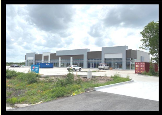
Retail Shopping Center 1636 Minonite Rd. (Bryan Rd. & FM 2977)