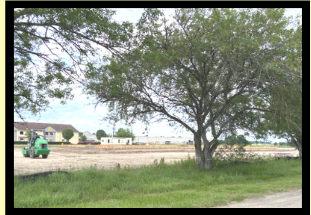
Sunbelt Equipment Rentals HWY 36 S & Wallace Wehring Way (in front of the National Guard Building)